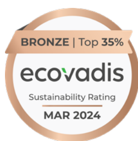
MEGGLE Bakery GmbH