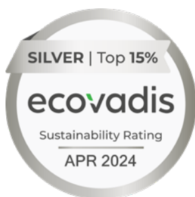
MEGGLE Cheese GmbH