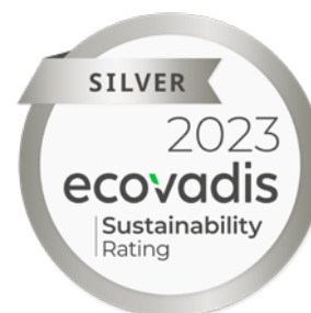
MEGGLE GmbH & Co KG